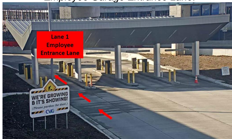
Employee Garage Entrance Lane:

This ticket will allow all valid CVG badged employees to park at no cost. Employees with expired badges, or those presenting tickets pulled from entrances other than Lane 1 will be charged $10/day. No refunds will be provided.