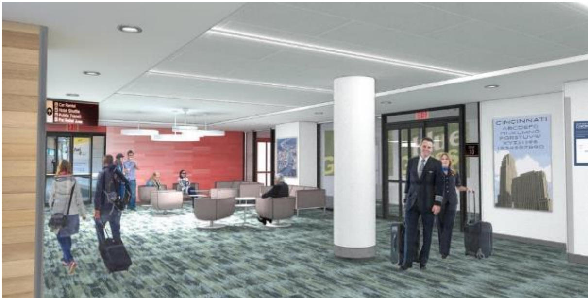
GROUND TRANSPORTATION ENTRY – ARTIST RENDERING