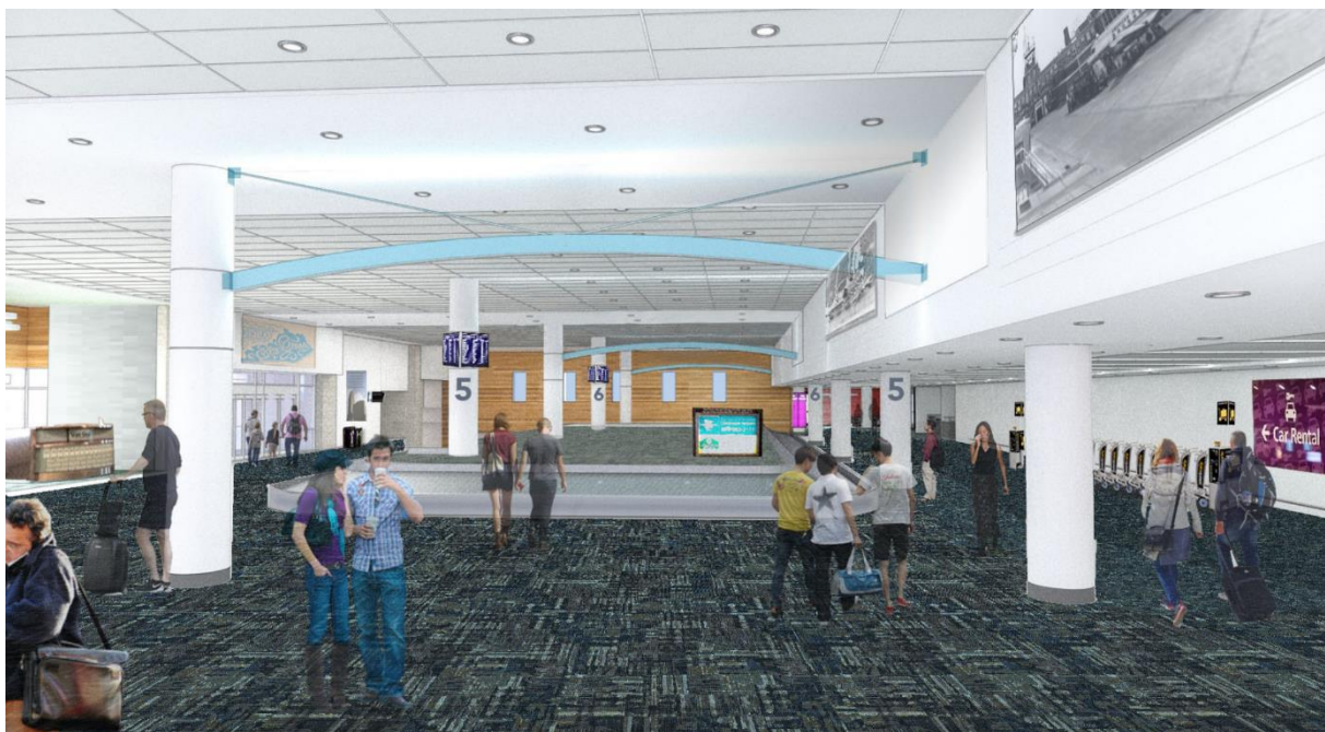
BAGGAGE CLAIM – ARTIST RENDERING